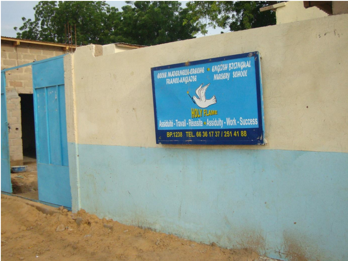
The entrance of the Kindergarten